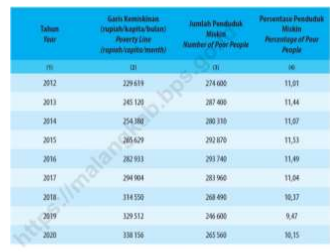
Figure 1. Poverty Line, number, and percentage of poor population in Malang Regency from 2012 to 2020

Examining the data, it is evident that a significant portion of Malang Regency is dedicated to agricultural land. Approximately 45,851 hectares are rice fields, 100,691 hectares are fields/gardens, and 26,534 hectares are plantation areas. (Central Bureau of Statistics of Malang City, 2021) This indicates that the community heavily relies on the agricultural sector due to the dominance of agricultural land in the region. Therefore, regional development planning becomes a crucial factor in resource improvement and the responsible development of the agricultural sector. Effective and efficient regional economic development planning requires a balanced approach and careful resource management.